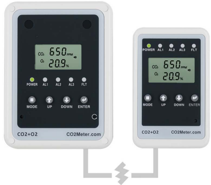
Part No. ESRAD-200-2

The Remote CO2 + O2 Storage Safety Alarm has both an audible alarm and flashing visual indicator when CO2 concentrations reach a pre-set level, or when oxygen drops below a pre-set level. Built-in relays can be used to control a ventilation fan, an HVAC control alarm, and to notify maintenance staff off-site.