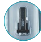
RS-232 to USB converter